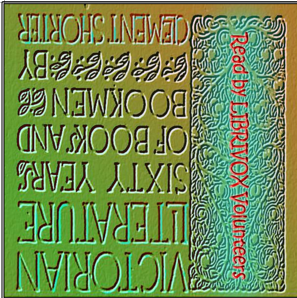
Cover image from 1897 edition of "Victorian Literature" Cover design for Librivox by Michele Fry

Easy Folding Instructions for this Origami CD case, including step by step photos, can be found here . Can also access from the LV Wiki page, CD Covers.